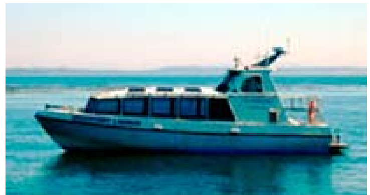
Company: Discovery Launch Port: Bedwell, BC Boat Names: Discovery Launch Owner: Cell: Status: Occasional