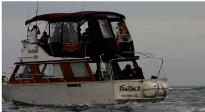
Company: Fantasea Charters Port: Victoria, BC Boat Names: Fanatasea IV Owner: Phone: WWOANW: No Status: Occasional