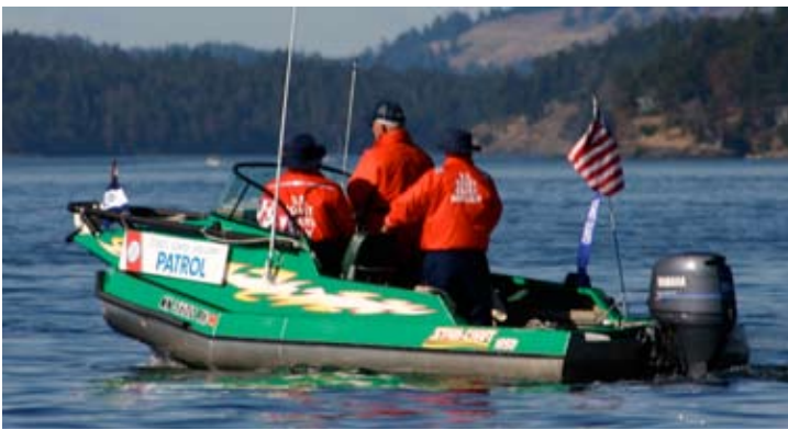
Company: Coast Guard Aux. Port: Various Boat Names: Owner: Cell: Status: Occasional