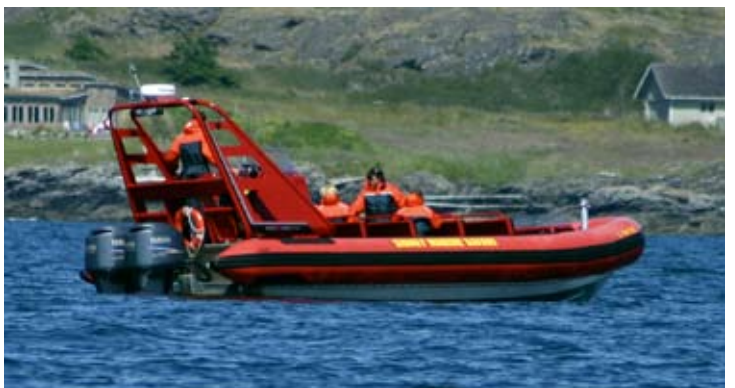
Organization: Sidney Marine Safari Port: Salt Spring, BC Boat Name(s): Jing-Jing Contact: Phone: Phone: WWOANW: No Status: Active